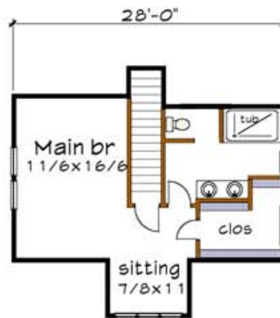
Floor 2 plan

Size fl 1 967 Size fl 2 485 Size Total 1452