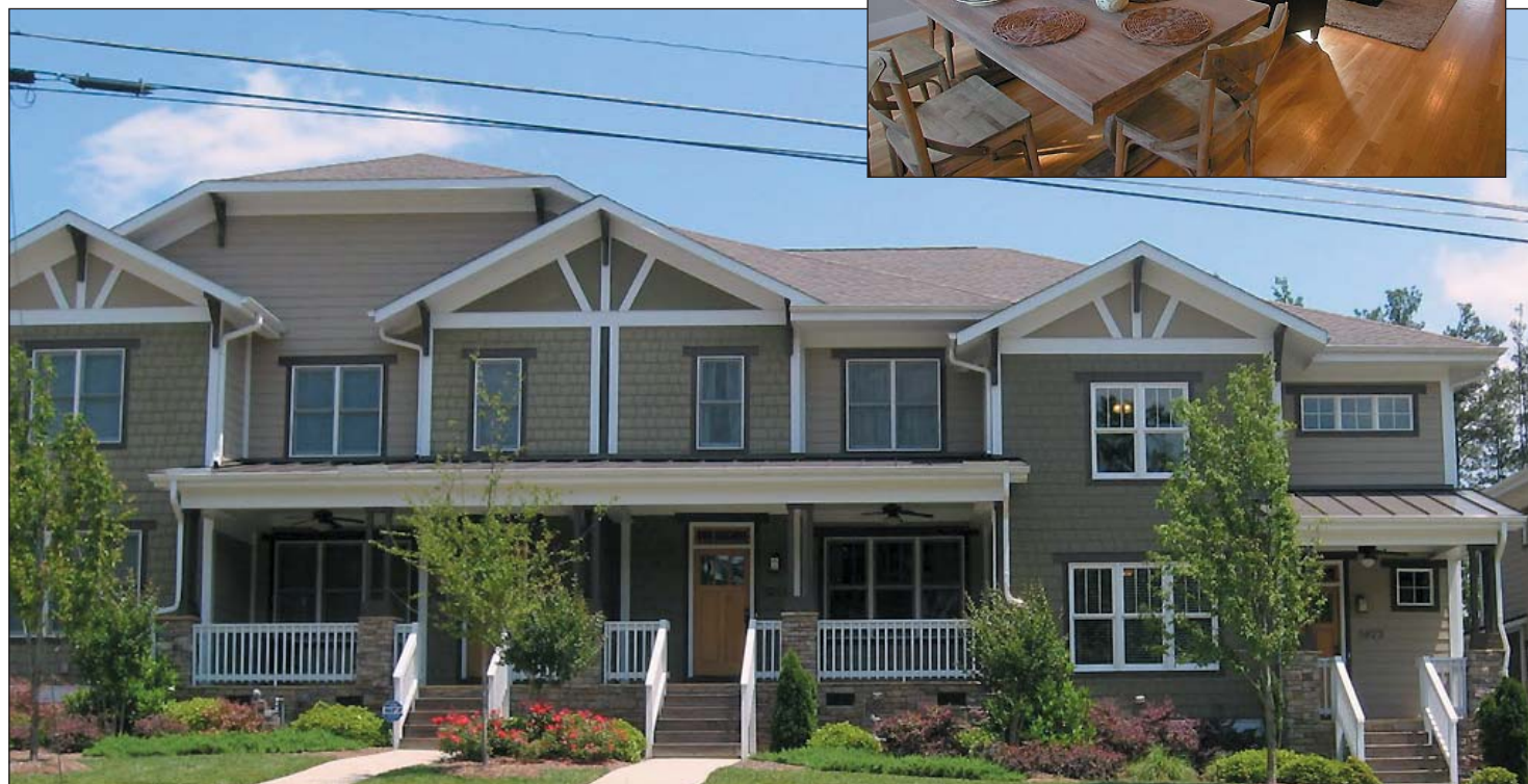
Located off Southwest Durham Drive, one mile from the I-40/15-501 intersection and a half mile to restaurants and shopping, Patterson Glen features Craftsman-style townhomes of 1,605 to 2,113 square feet, priced from $265,000.